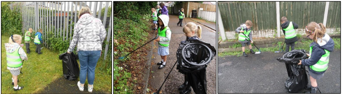
Reception showing respect and responsibility for our local environment by litter picking.