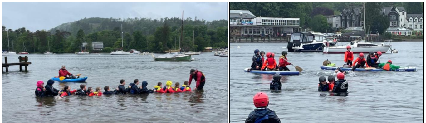
Y6 using their value of courage when kayaking and paddleboarding on Lake Windermere.