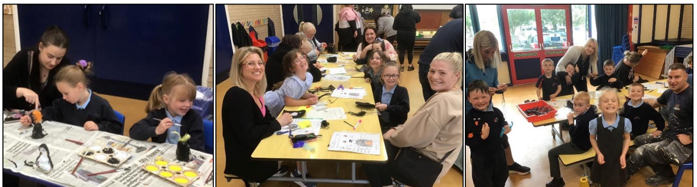
Y1 designers (with the help of their parents) creating their hand puppets and decorating their clay penguins.