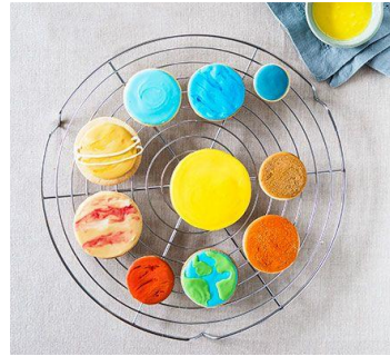
Solar System in a Jar