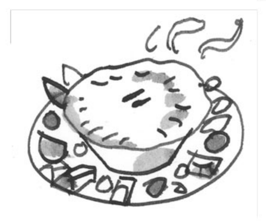
Steak and kidney pudding and fruit cocktail.