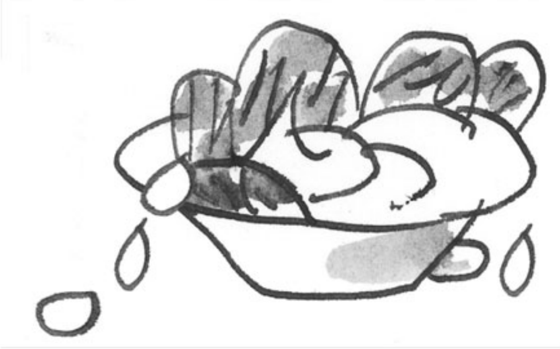
And Grandpa's speciality, Spam à la Custard.