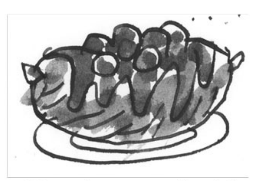
Haggis topped with cherries in syrup.