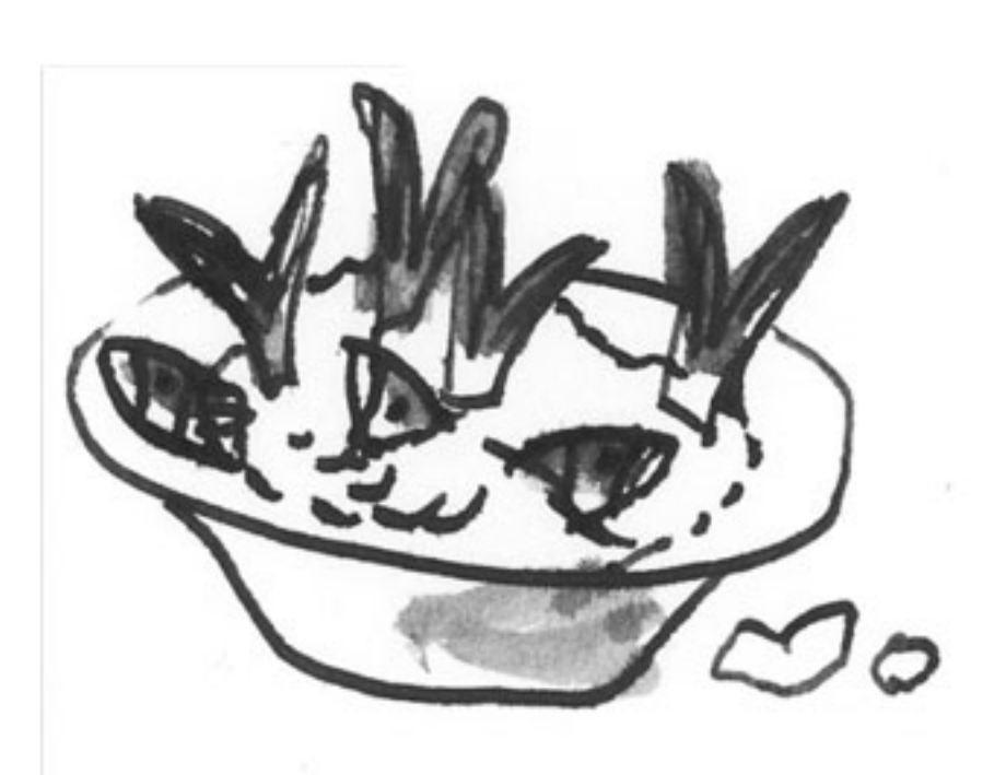
Sardines and rice pudding.