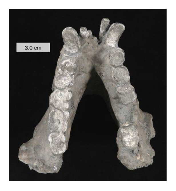
Fossil jaw of Gigantopithecus blacki, an extinct primate