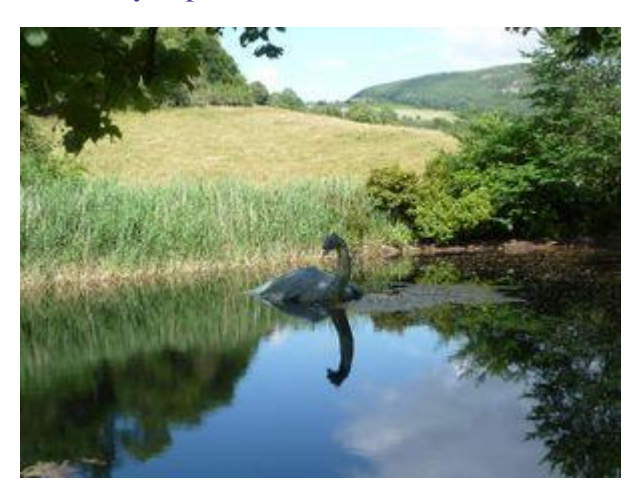
Man made Loch Ness Monster in a lake

The Loch Ness Monster , also referred to as Nessie , is a supposed animal, said to live in the Scottish loch of Loch Ness, the second biggest loch in the country. The Loch Ness Monster story was big in the field of cryptozoology.