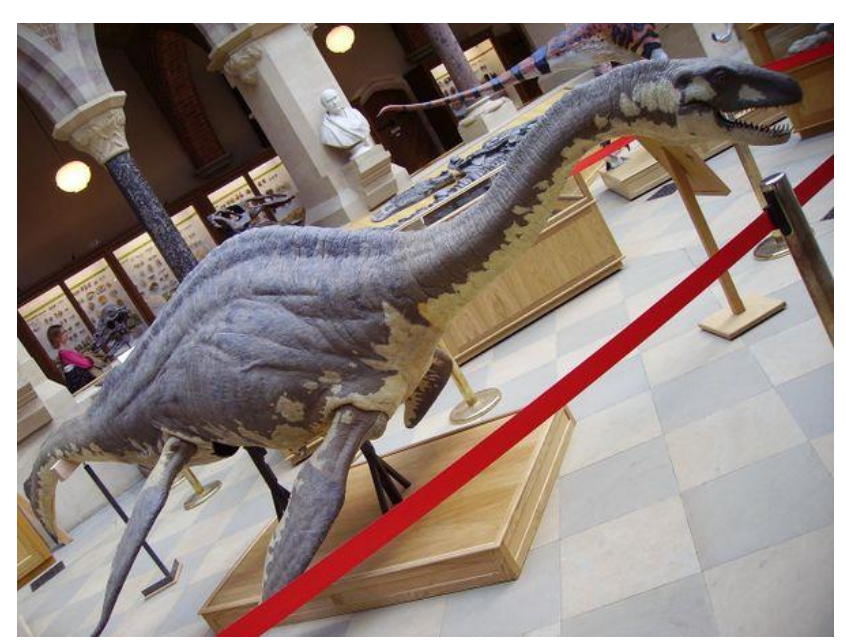
Cryptoclidus model used in the Five TV programme, Loch Ness Monster: The Ultimate Experiment