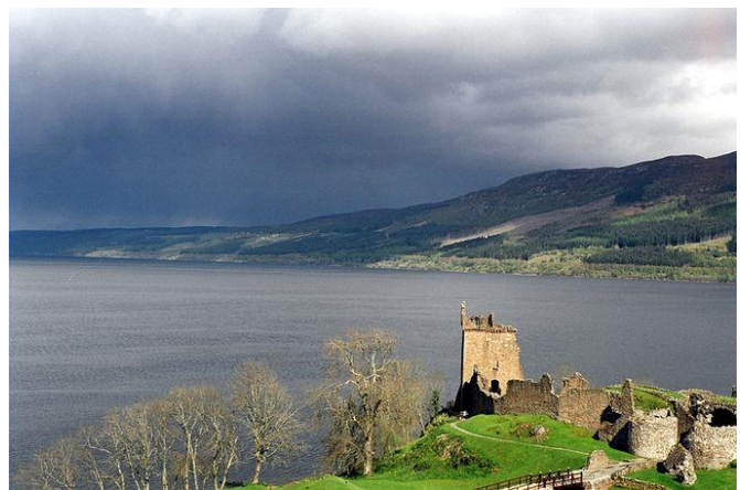
Loch Ness, reported home of the monster